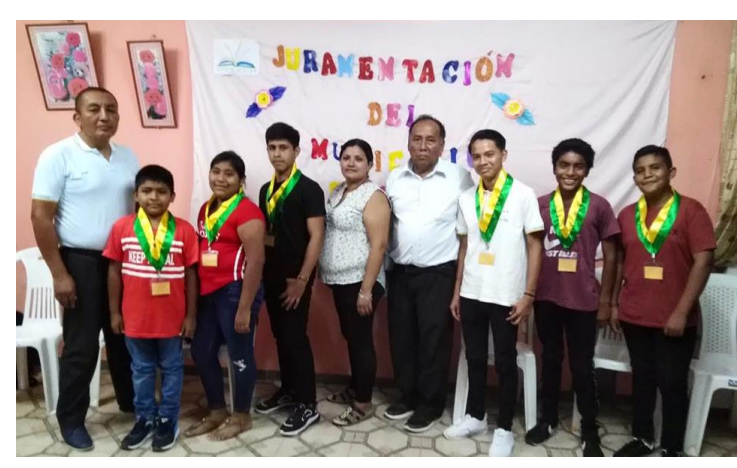
The newly elected student council for the 2020 year.